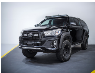
TOYOTA HILUX ROOF MOUNTING KIT