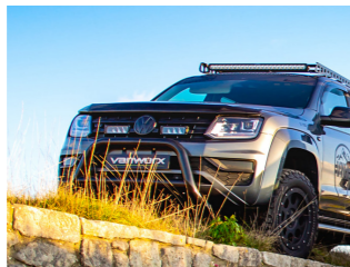
VW AMAROK 2016+ GRILLE INTEGRATION KIT