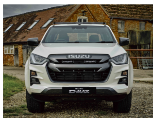
ISUZU D-MAX 2021+ FRONT GRILLE MOUNT KIT