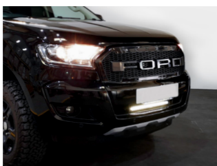
FORD RANGER 2016+ LOWER GRILLE MOUNTING KIT