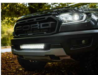
FORD RAPTOR 2018+ LOWER GRILLE MOUNTING KIT