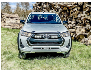
TOYOTA HILUX 2021+ GRILLE INTEGRATION KIT