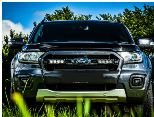
FORD RANGER 2019+ GRILLE INTEGRATION KIT