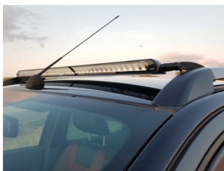
FORD RANGER / RAPTOR ROOF MOUNTING KITS